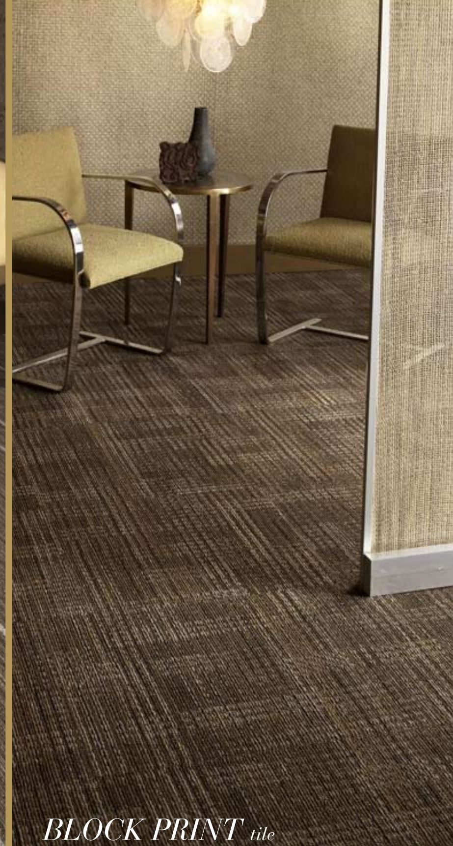
BLOCK PRINT tile

The Egyptians used glass. Native Americans favored seeds. The Romans used pearls. We envisioned a totally new mode of adornment: METALLIC SLASHES against a subtly textured, linear background.